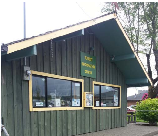
Downtown Visitor's Center on Commercial Street

Have you checked out the Chamber Facebook page? The page is often updated with upcoming events, movies, concerts and important community news. Next time you are there, why not 'share' the page and help us share our community events with others!