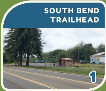
SOUTH BEND TRAILHEAD