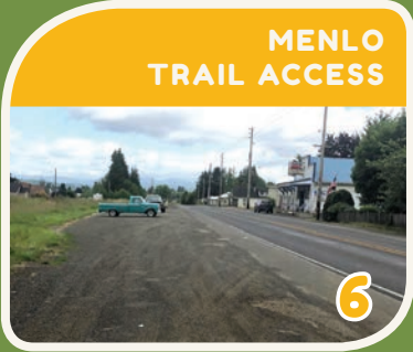
MENLO TRAIL ACCESS