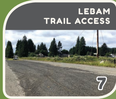
LEBAM TRAIL ACCESS