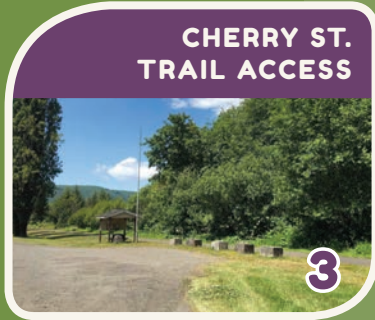
CHERRY ST. TRAIL ACCESS