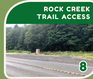
ROCK CREEK TRAIL ACCESS