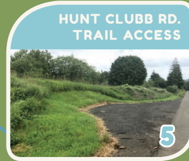
HUNT CLUBB RD. TRAIL ACCESS